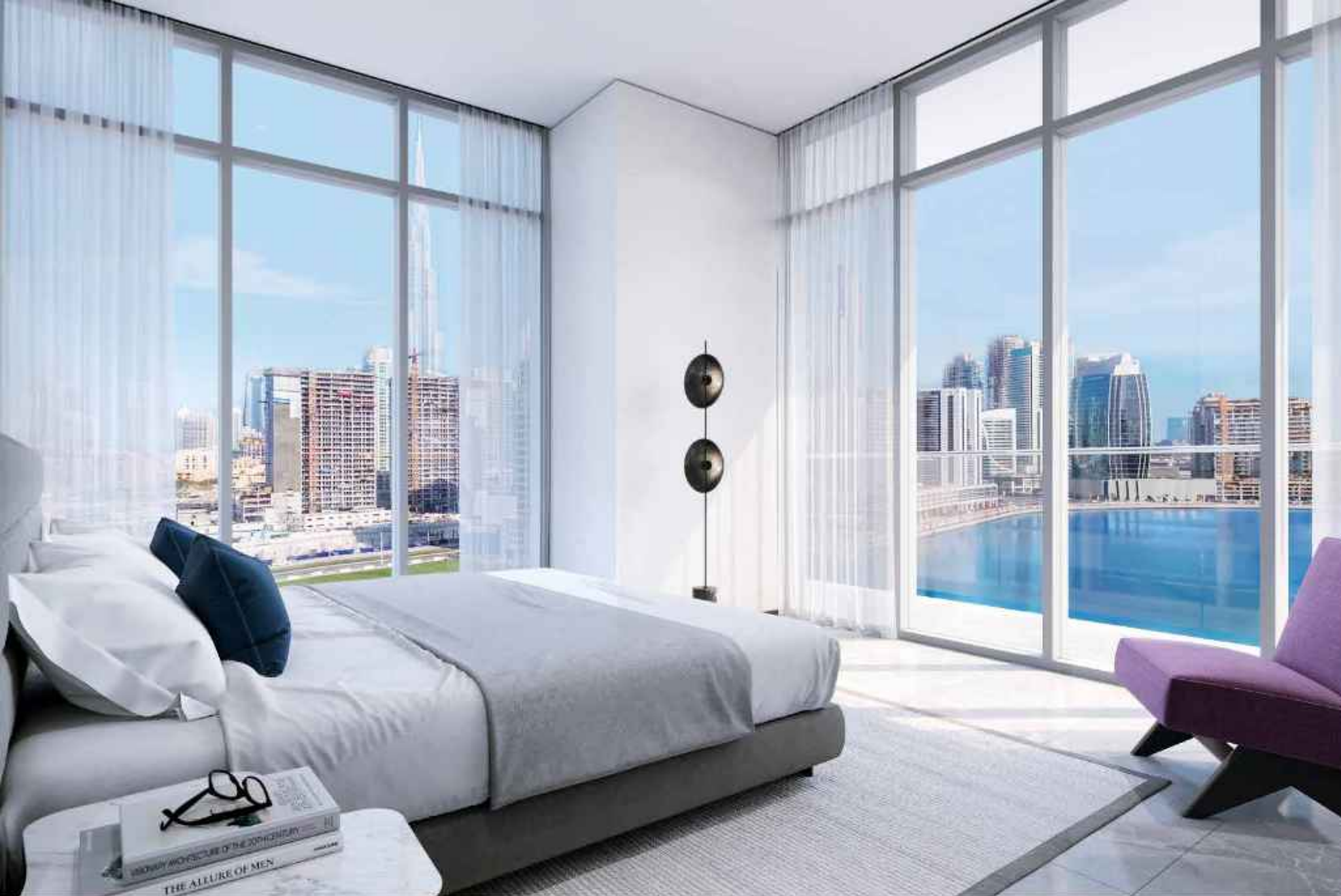
WATERFRONT VISTAS PICTURESQUE VIEWS OF THE CANAL